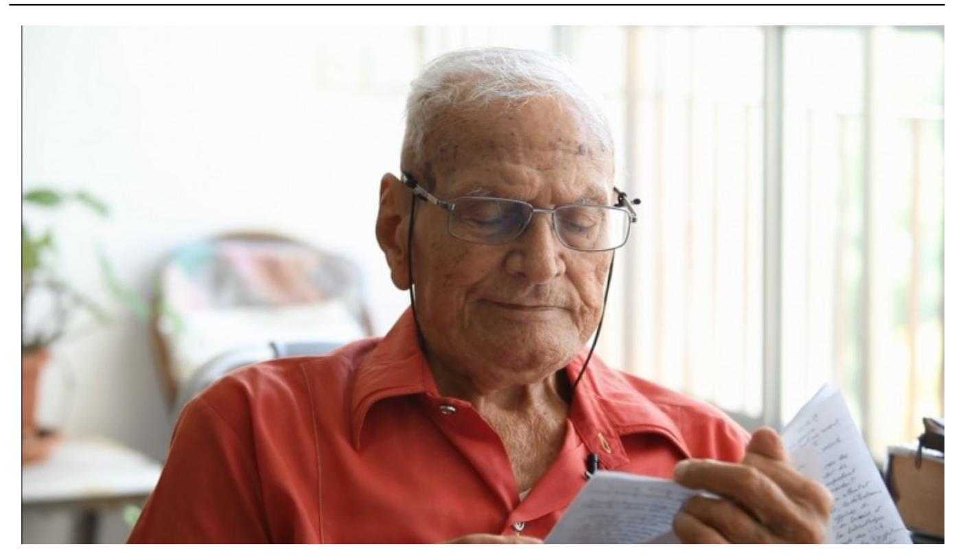
[10]Still from Haidi Motola's Esperia: Last Day in Cairo, Part I (2018, 29 MIN, HD)