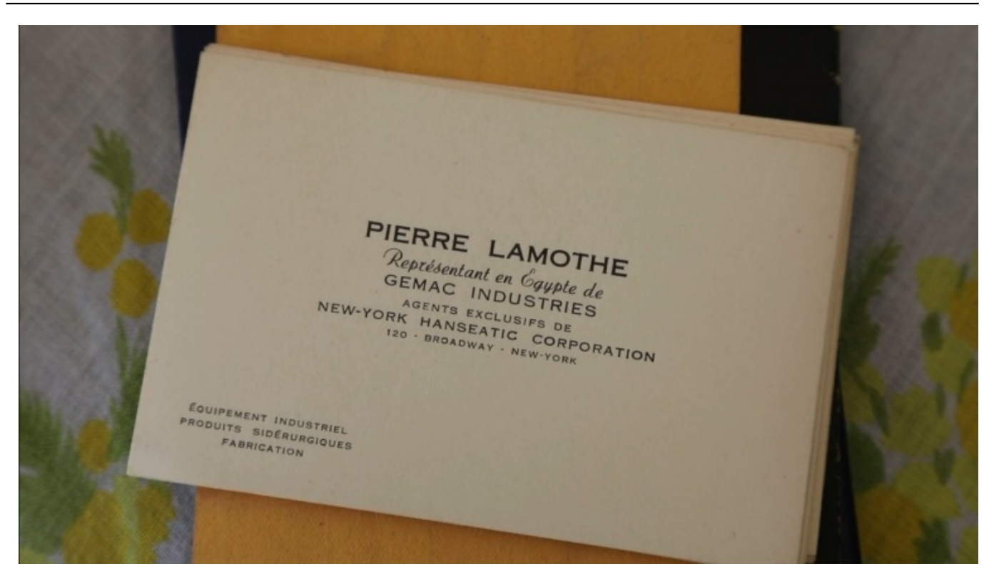
[12]Still from Haidi Motola's Esperia: Last Day in Cairo, Part I (2018, 29 MIN, HD)

Motola was not the first Paris-educated Israeli artist to be recruited to the Israeli secret service. In his video work, Art Undercover [13] (2017), artist Tamir Zadok reimagines the story of Shlomo Cohen Abarbanel, a painter and a former Mossad agent who served in Egypt in the 1950s under the assumed identity of a French painter named Charduval. Abarbanel's cover was so convincing that he was given a solo exhibition at Museum of Modern Art in Cairo. The similarities between Abarbanel's story and Motola's are not incidental. The two became close friends after they met at Lhote's studio in Paris, years before they had served together in Egypt. Unlike Motola, Abarbanel kept climbing the ranks of the Israeli Mossad until he became the organization's deputy-director. Motola, apparently, was a lot less driven: "I travelled to Egypt for the adventure... they couldn't find someone in Israel who would agree to do it", he says in the film, insisting that he had joined the service mainly for the sake of "action." A moment before that, he lists his catalogue of nationalities (French-Algerian-Egyptian-Palestinian,) but leaves his Israeli one out. When asked by the filmmaker if he identifies himself as an Israeli he says, "No. It's weird, I don't feel that I'm an Israeli," and leaves it at that.