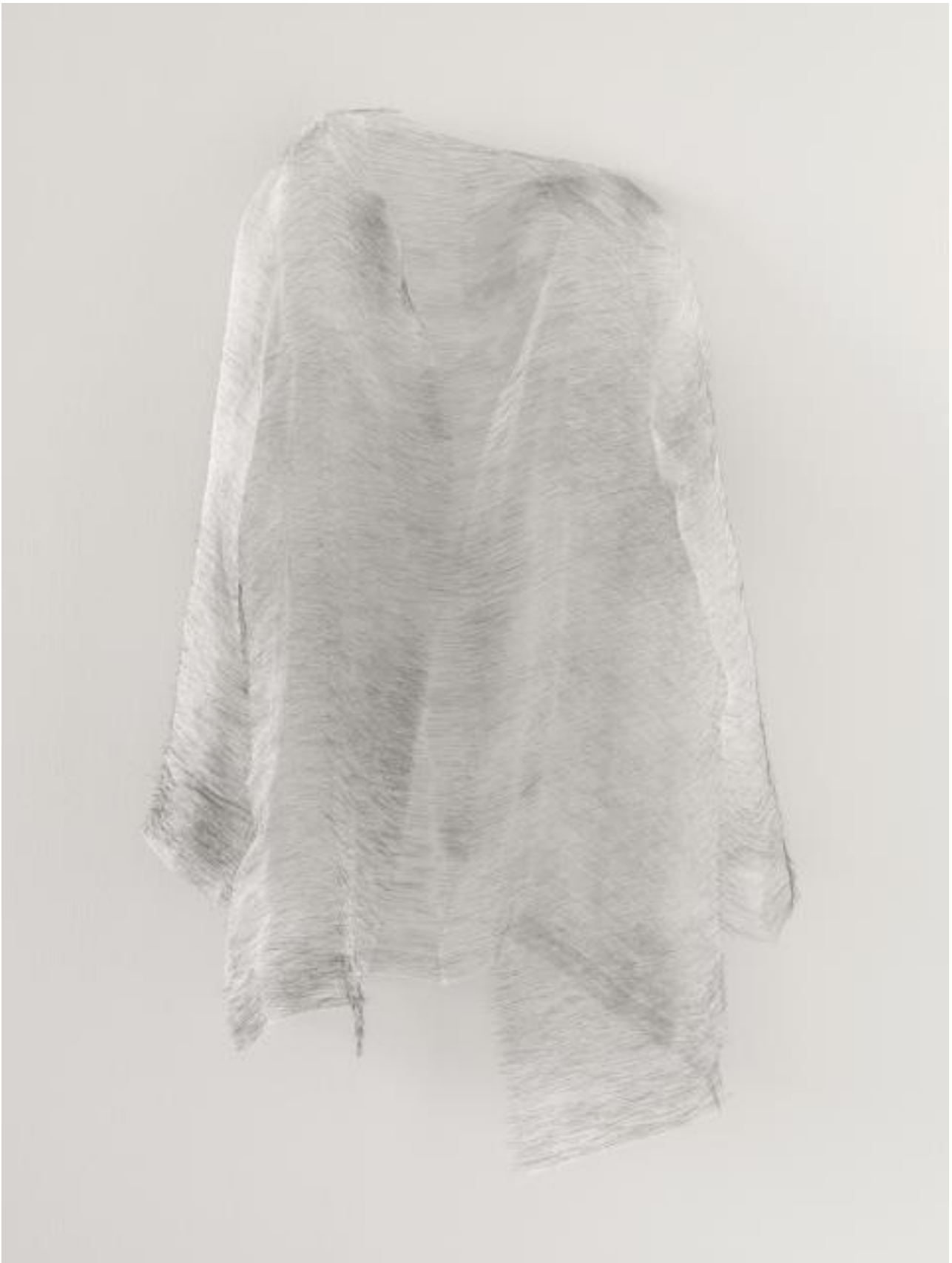
[9]Doris Salcedo, Disremembered I 2014, Silk thread and sewing needles, 89 x 55 x 16 cm. Collection of Diane and Bruce Halle