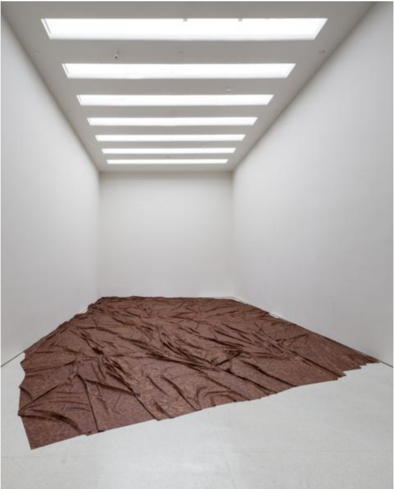
[1]Doris Salcedo, A flor de Piel Installation view: Doris Salcedo, Solomon R. Guggenheim Museum, New York. June 26th – October 12th, 2015.