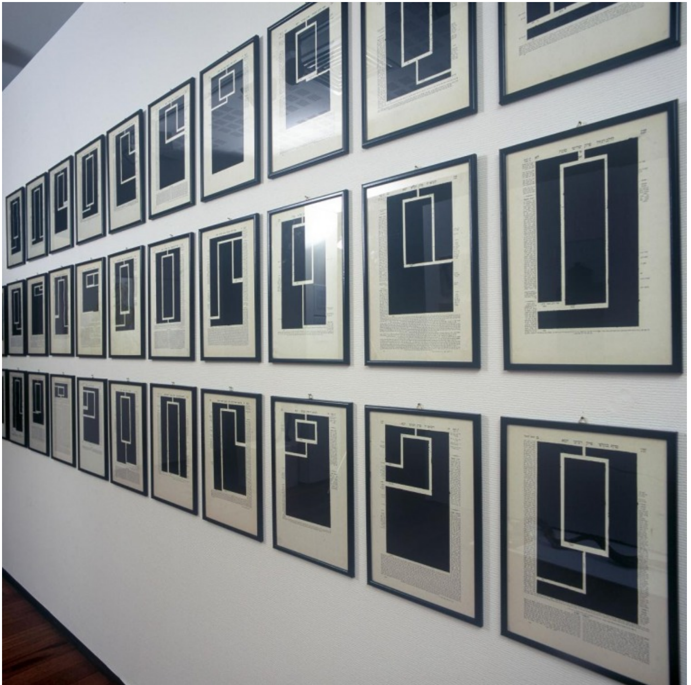
[9]An Introduction to the Principle of Relative Expression, 1979, black oil crayon on pages from the Babylonian Talmud, 27X40 cm each