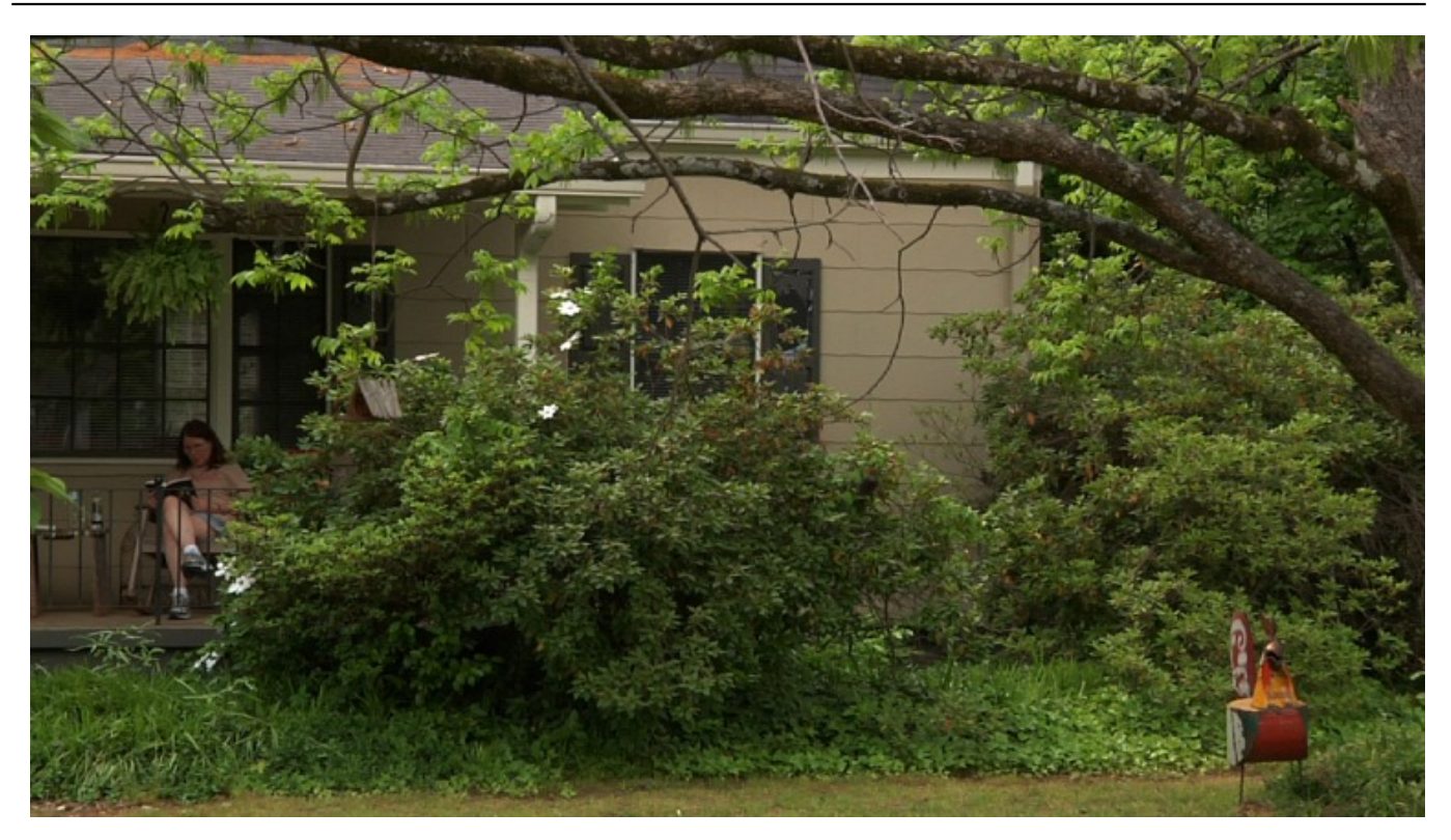
[25]Efrat Vital, Normal Town, 2012 Still from a video