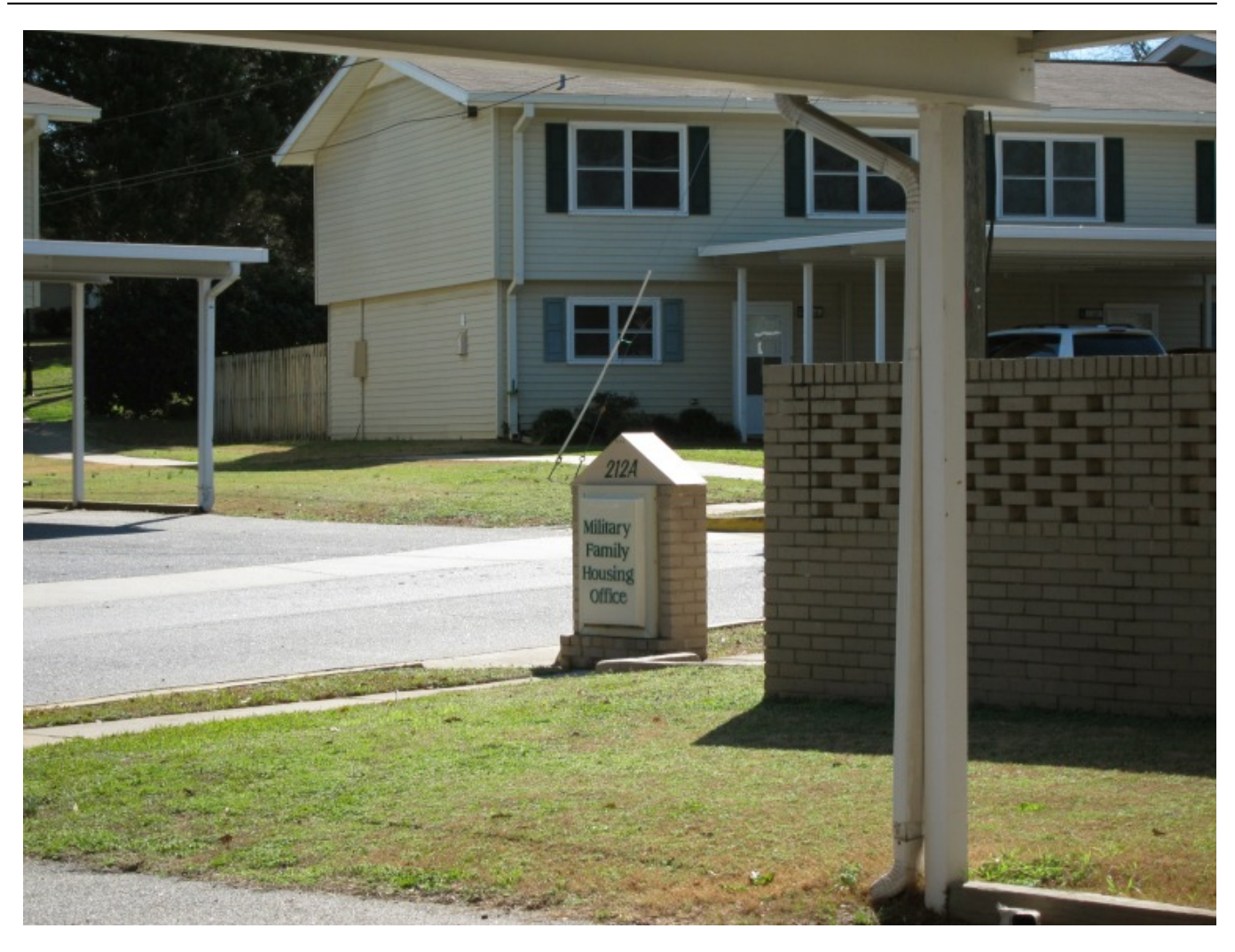
[7]Efrat Vital, Normal Town, 2012 Stills from a video