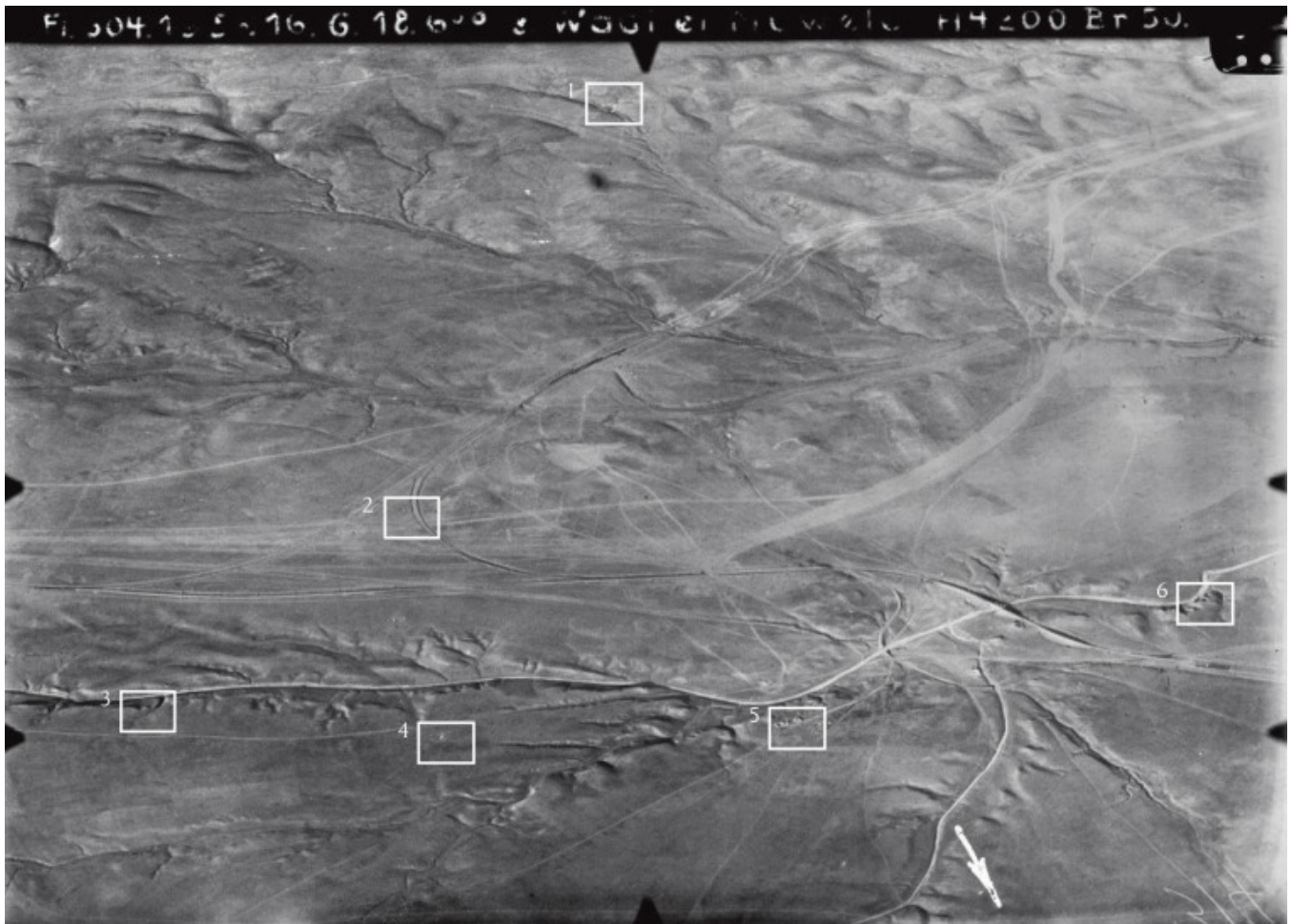
[12]Tall al-Sharia, Bavarian Squadron 304, August 24, 1918