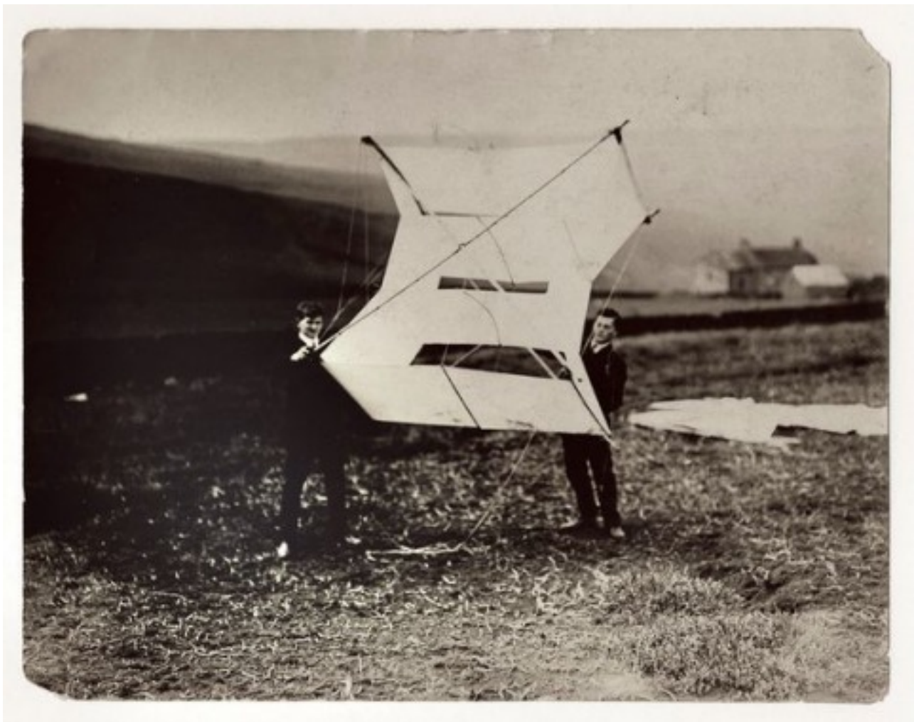
[1]Ludwig Wittgenstein and William Eccles at the kite station in Glossop, England, 1908 Public domain image

They say that in 1927, when Ludwig Wittgenstein renewed his contact with the members of the Vienna Circle, after his long period of silence following the publication of his first book, Tractatus Logico-Philosophicus , he refused at first to discuss technical philosophical issues with them. Instead,