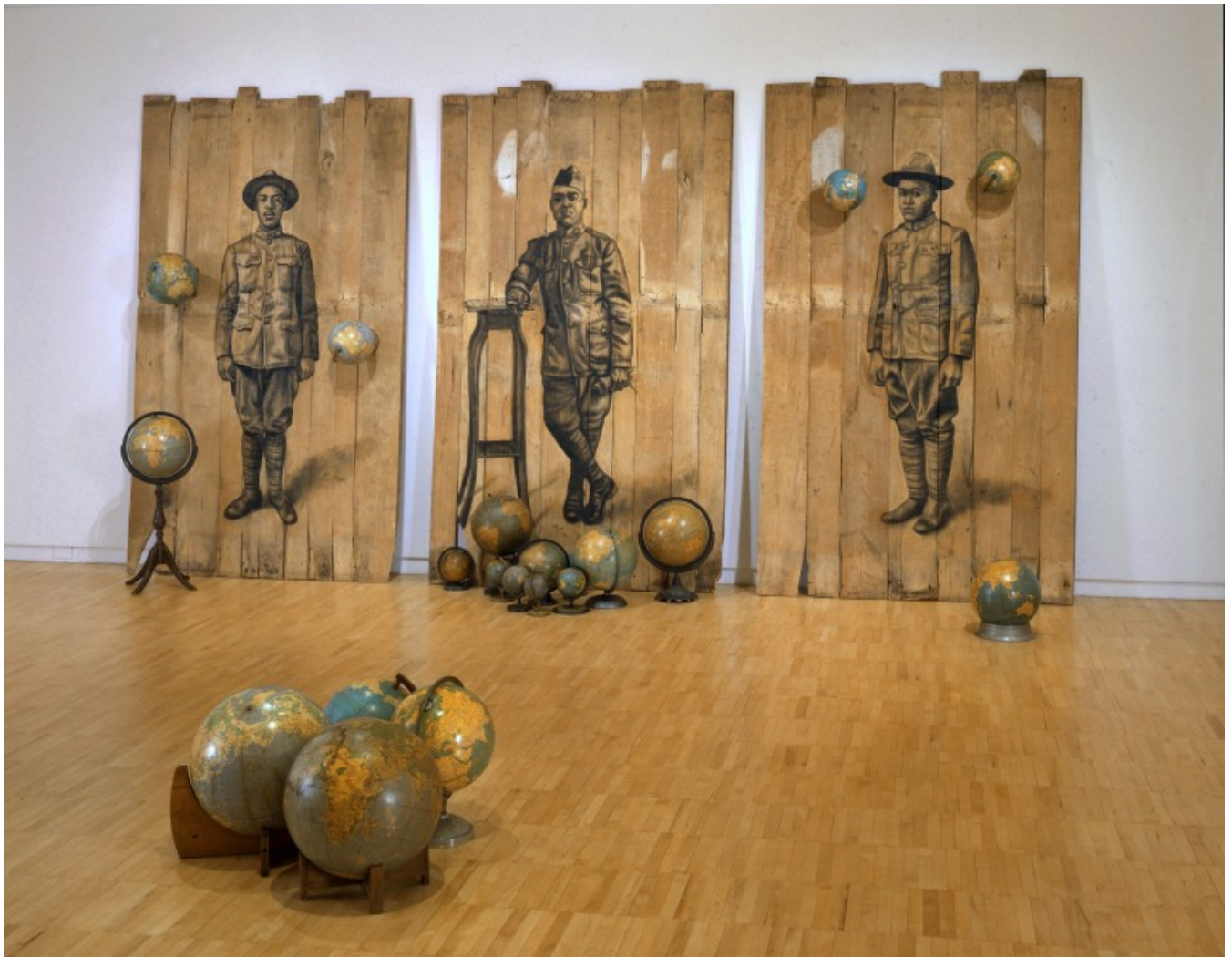
[3]Whitefield Lovell. Autour du monde , 2008 Conte on wooden boards, with balls. 102X189X171 cm