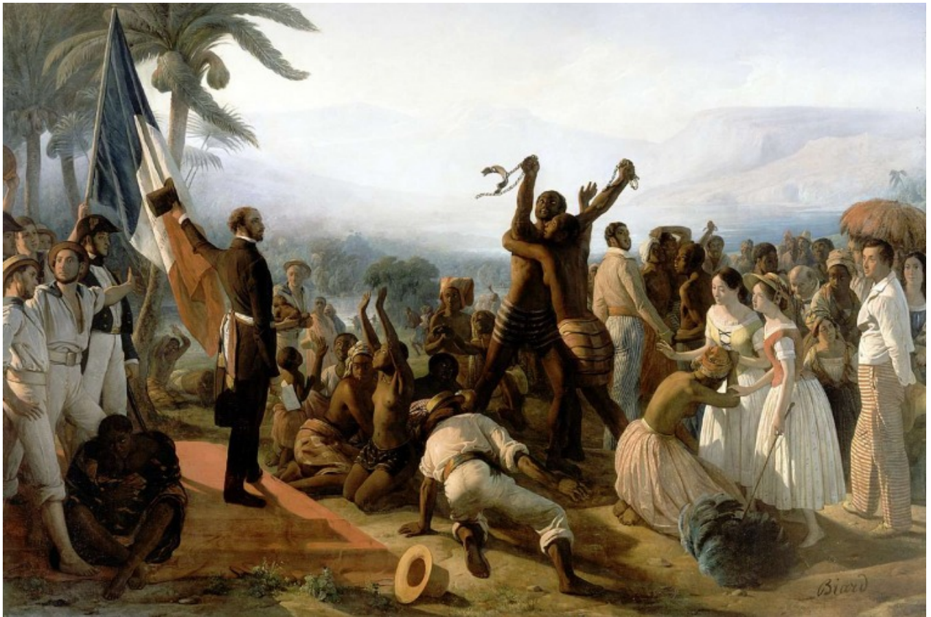
[8]François-Auguste Biard. Proclamation of the Abolition of Slavery in the French Colonies, April 27, 1848

Oil on canvas. 392X260 cm. Versailles Palace, Versailles, France