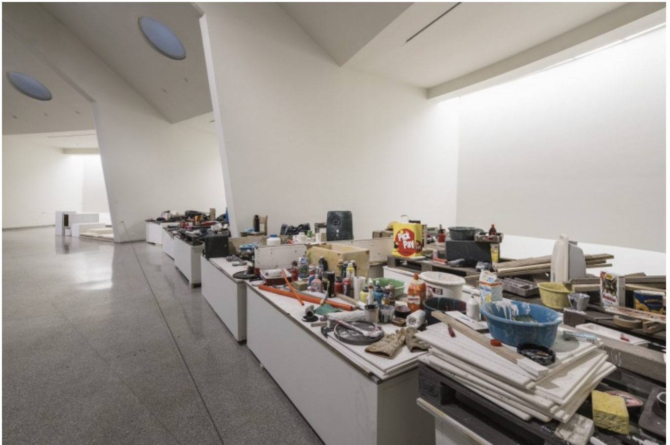
[5]Installation view: Peter Fischli David Weiss: How to Work Better 2016.