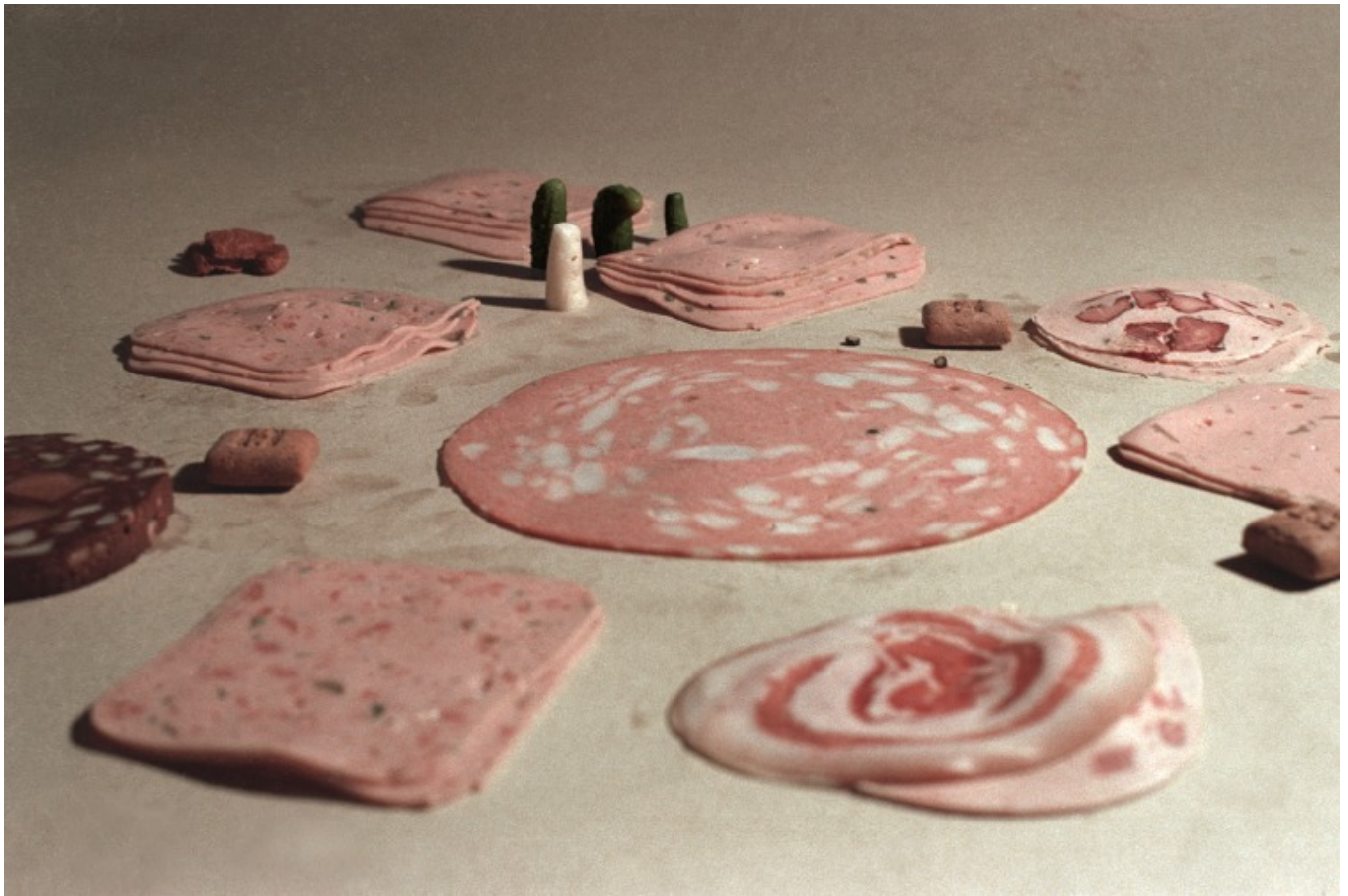
[9] Peter Fischli David Weiss. At the Carpet Shop (from Sausage Series ), 1979 Chromogenic print, 24 x 36 cm

Walker Art Center, Minneapolis, Clinton and Della Walker Acquisition Fund, 1993 © 2015, Peter Fischli and David Weiss