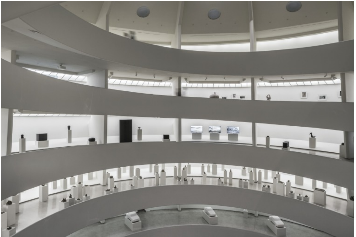
[1]Installation view: Peter Fischli David Weiss: How to Work Better 2016.