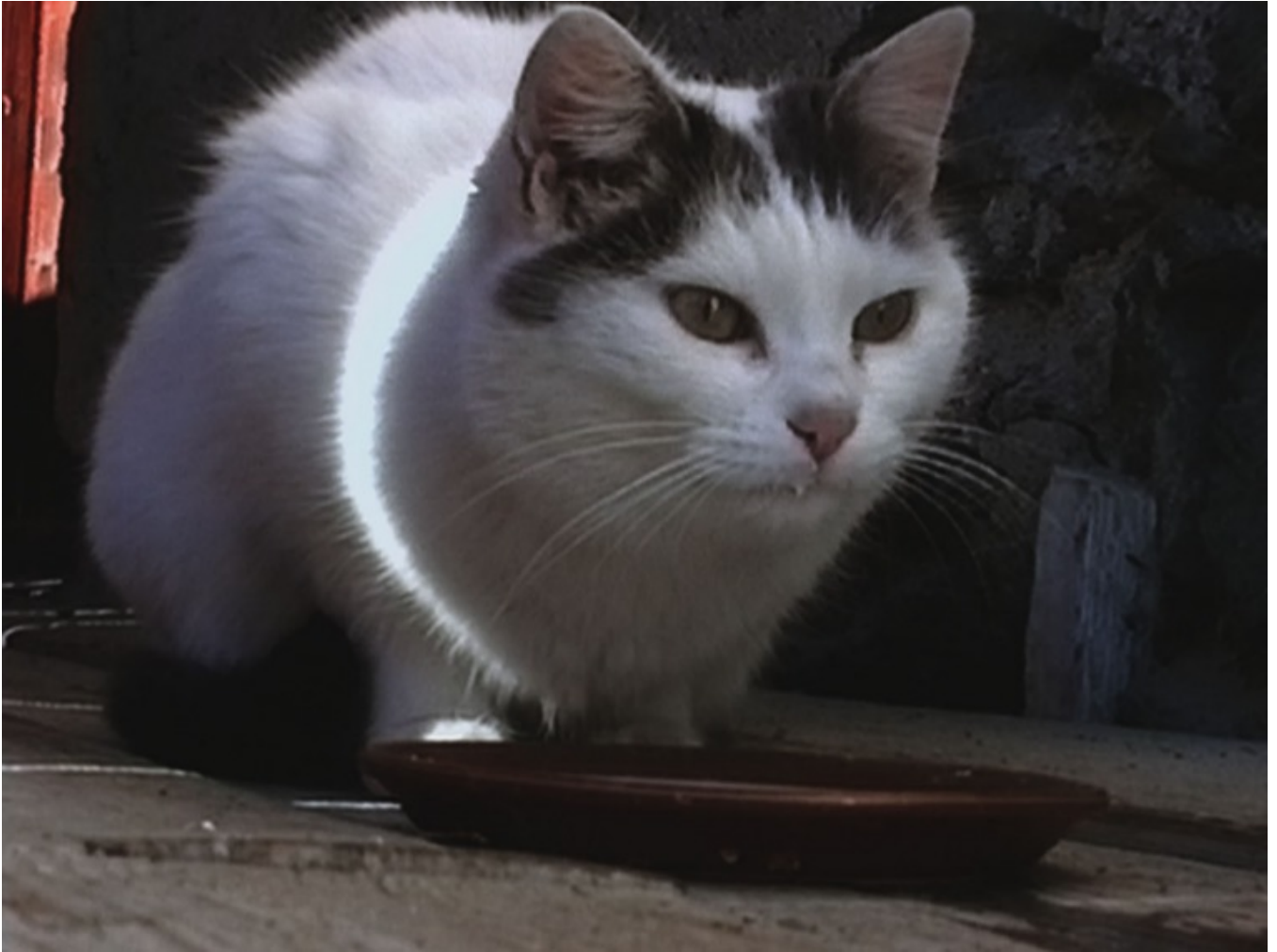
[11]Peter Fischli David Weiss. Büsi (Kitty), 2001 Color video, silent, 6 min., 31 sec. Solomon R. Guggenheim Museum, New York, Gift, Matthew Marks 2015.19