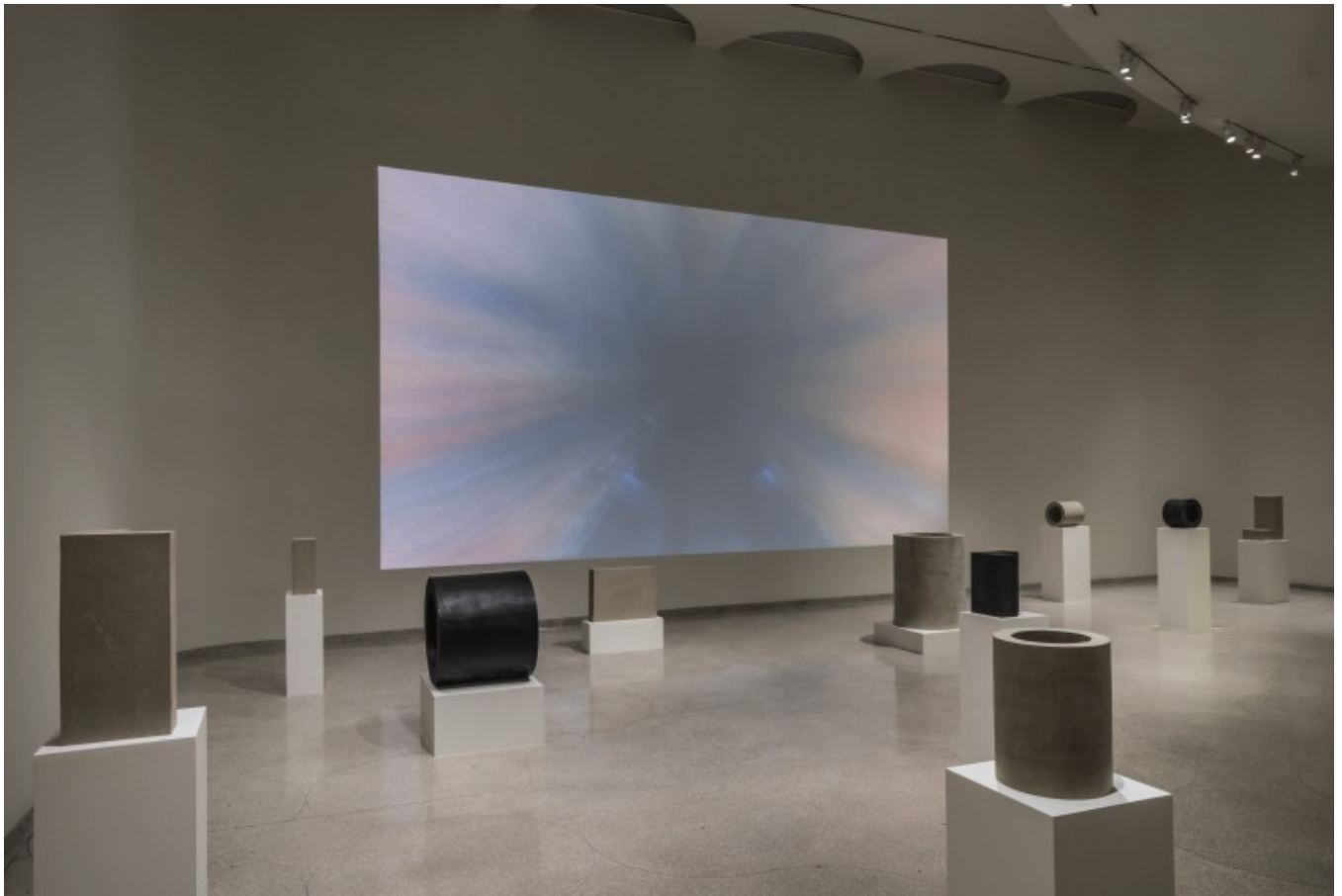
[3]Installation view: Peter Fischli David Weiss: How to Work Better

The exhibition leads the viewers from one project to the next, each in itself superfluous. There are plenty of sculptures, like Cars (1988); a lot of photographs, such as Visible Worlds (1986-2012), a series of tourist-style pictures of sites around the world in sunny weather, and Airports (1987-2012), taken in airports around the world in any kind of weather; hours and hours of video footage, documenting daily activities of labor and leisure – I happened to witness a woman measuring and evaluating cats in a competition – in Untitled (Venice Work) (1995); and lest we forget, the number of objects the artists have carved from polyurethane and then colored (1991-), to achieve the true likeness of the equipment and, well, stuff, in an artist's studio, including paint tubes and pizza cartons, meticulously producing very persuasive not-readymades.