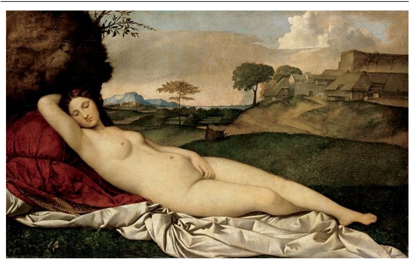
[6] Giorgione, The Sleeping Venus, oil on canvas, 108.5*175 cm. Gemaldegalerie Alte Meister, Dresden, circa 1510