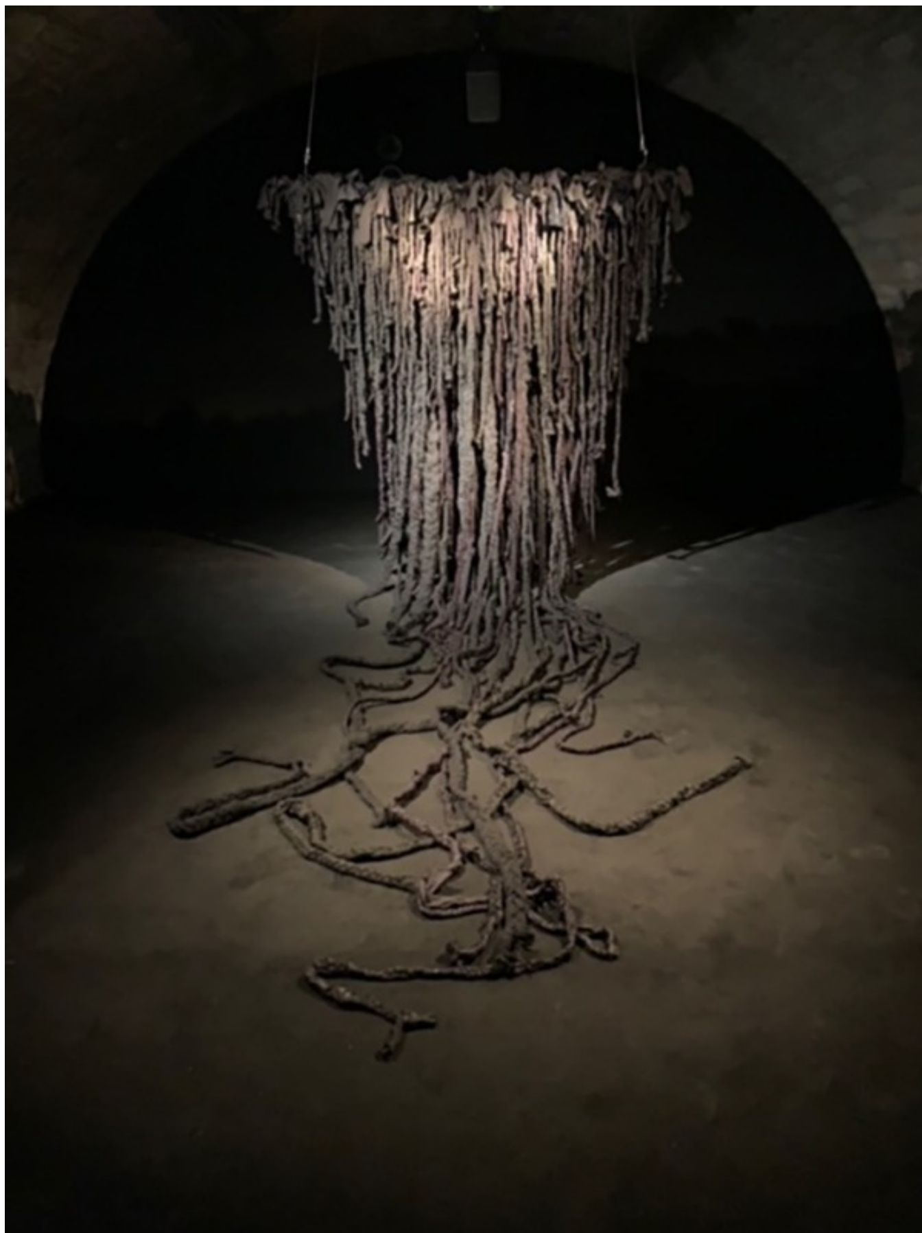
[1]Saodat Ismailova, Chilltan , 2022, installation view in documenta fifteen at Fridericianum Kassel (Entrance Hall)