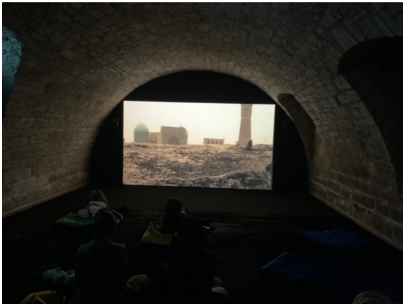
[7]Saodat Ismailova, Bibi Seshanbe (film), 2022, installation view in documenta fifteen at Fridericianum Kassel