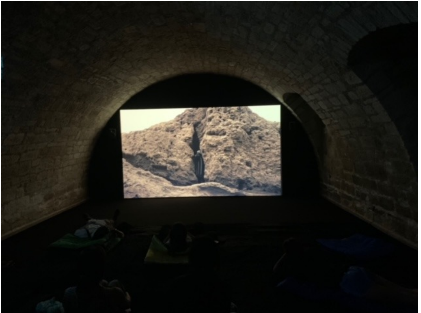
[11]Saodat Ismailova, Bibi Seshanbe (film), 2022, installation view in documenta fifteen at Fridericianum Kassel