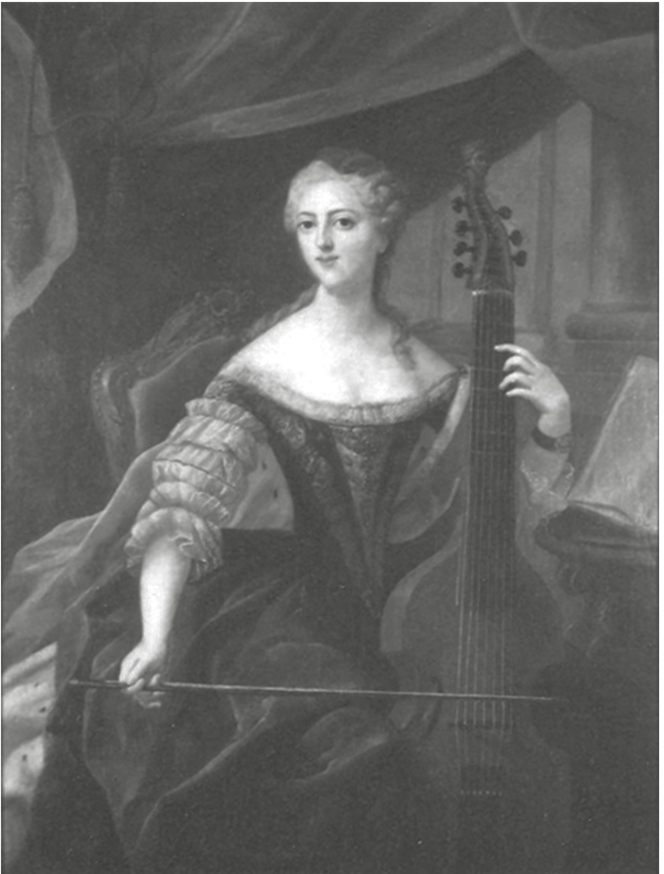
[6]Unidentified artist, Portrait of Isabella of Parma - Ducal Palace of Colorno (1741-1763), circa 1750-1774, oil on canvas, 125*95 cm