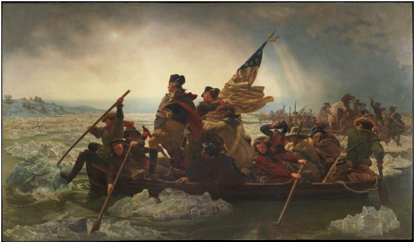
[12]Emanuel Leutze, Washington Crossing the Delaware, 1851, oil on canvas