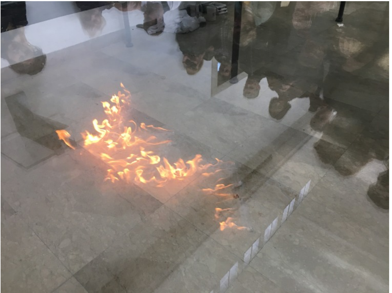
[17]Anne Imhof, Faust, 2017 (installation view) German Pavilion, 57th Venice Biennale