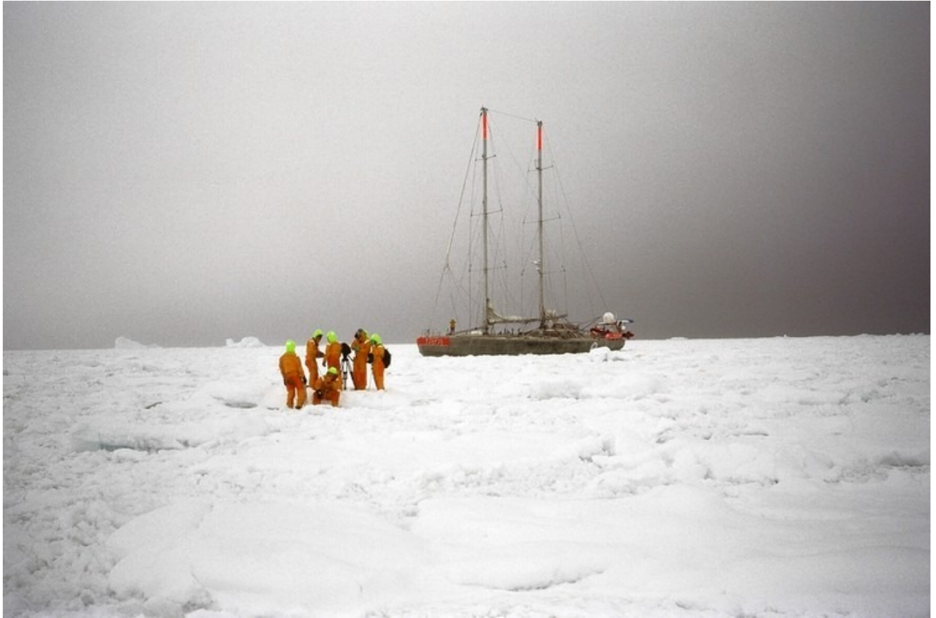
[49]Pierre Huyghe, A Journey that Wasn't , 2005

The film opens with a narrator describing the circumstances of going on a journey that never was: On February 9, 2005, an expedition of seven artists and ten crew members left the port of Ushuaia, the capital of Tierra del Fuego, in south-east Argentina. The expedition, initiated by Huyghe, set out to search for a mysterious creature, a solitary albino penguin, rumored to live on an unmapped island on the Arctic Circle, which the receding ice sheet has exposed. After the introduction, Huyghe's film joins together two events: footage of the journey (Arctic landscapes, the expedition's ship, and the crew working under harsh conditions), and its re-creation as a sophisticated audio-visual spectacle at the Central Park skating rink in New York. The misty Central Park scene adds a touch of science fiction to the work. Towards the end of the film the fictional creature – the albino penguin – the object of the journey, appears. Huyghe also places a stuffed version of the penguin in the exhibition space, hanging upside-down from the ceiling.