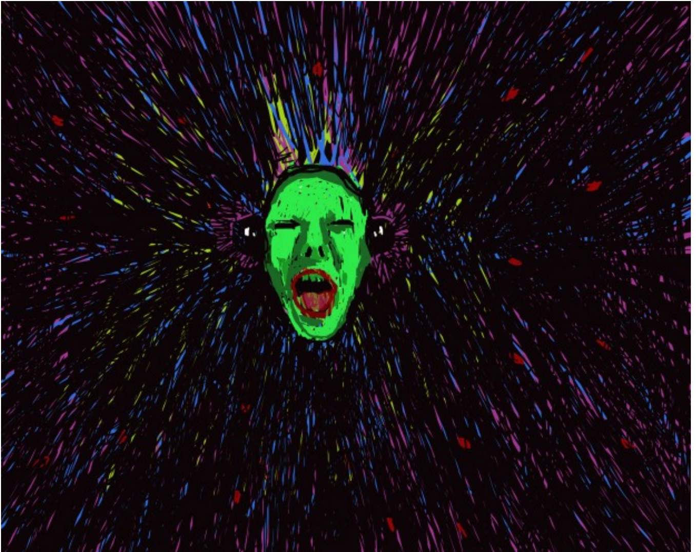
[7]Benedict Drew: The Trickle-Down Syndrome Whitechapel Gallery