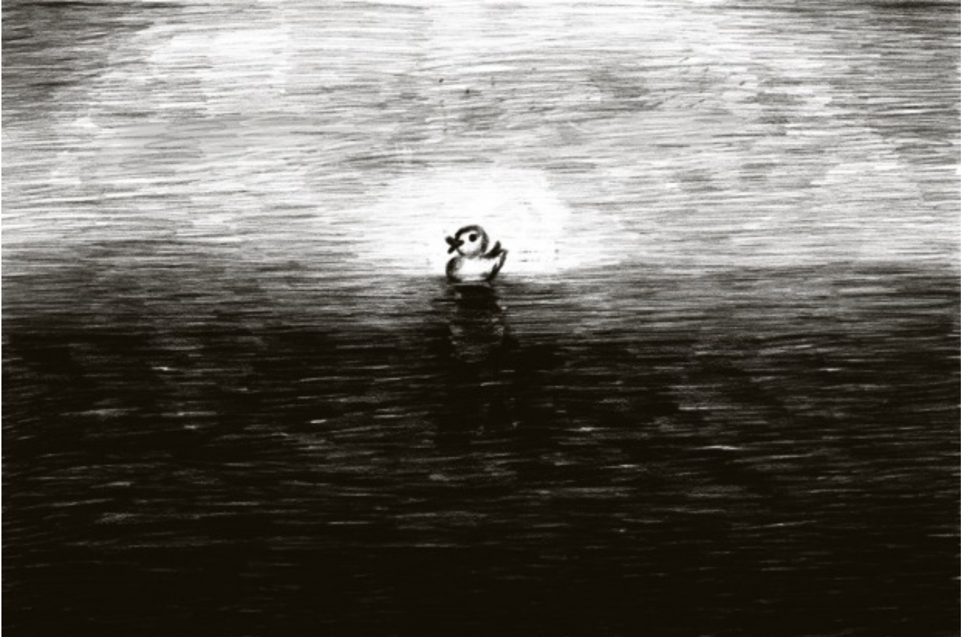
[5]Reaction to Hiroshi Sugimoto