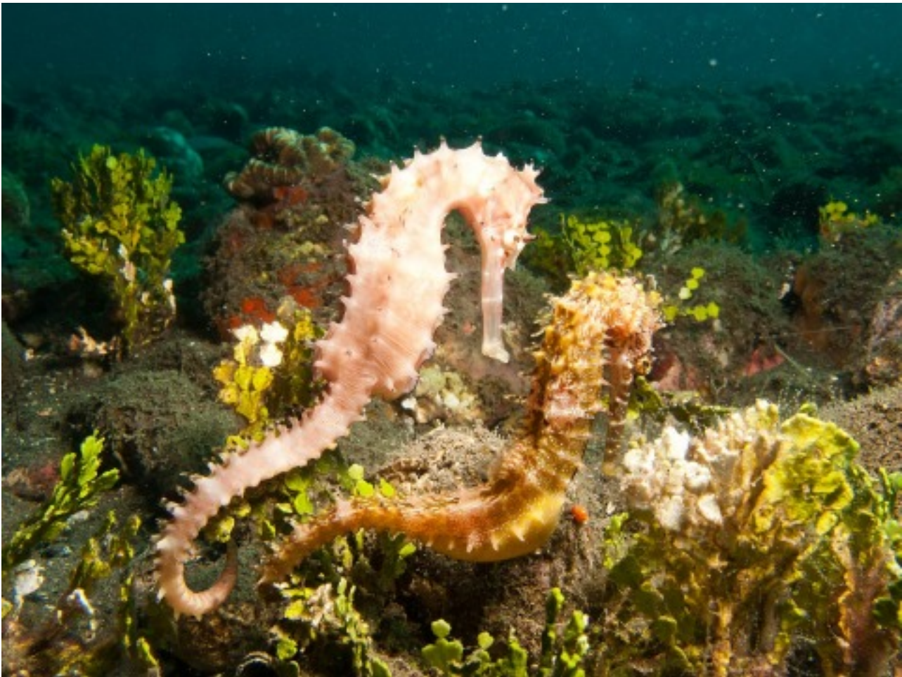
[15]Sea horse Public domain image

Sea horses are known as a species in which the male can also conceive. Their bodies are covered with bony plates, and their tails lack fins and are used for anchoring rather than swimming - this is a fish with poor swimming skills, which most of the time holds on to marine plants to avoid being swept by currents. The sea horse does not have a stomach, and food passes through its body very quickly.