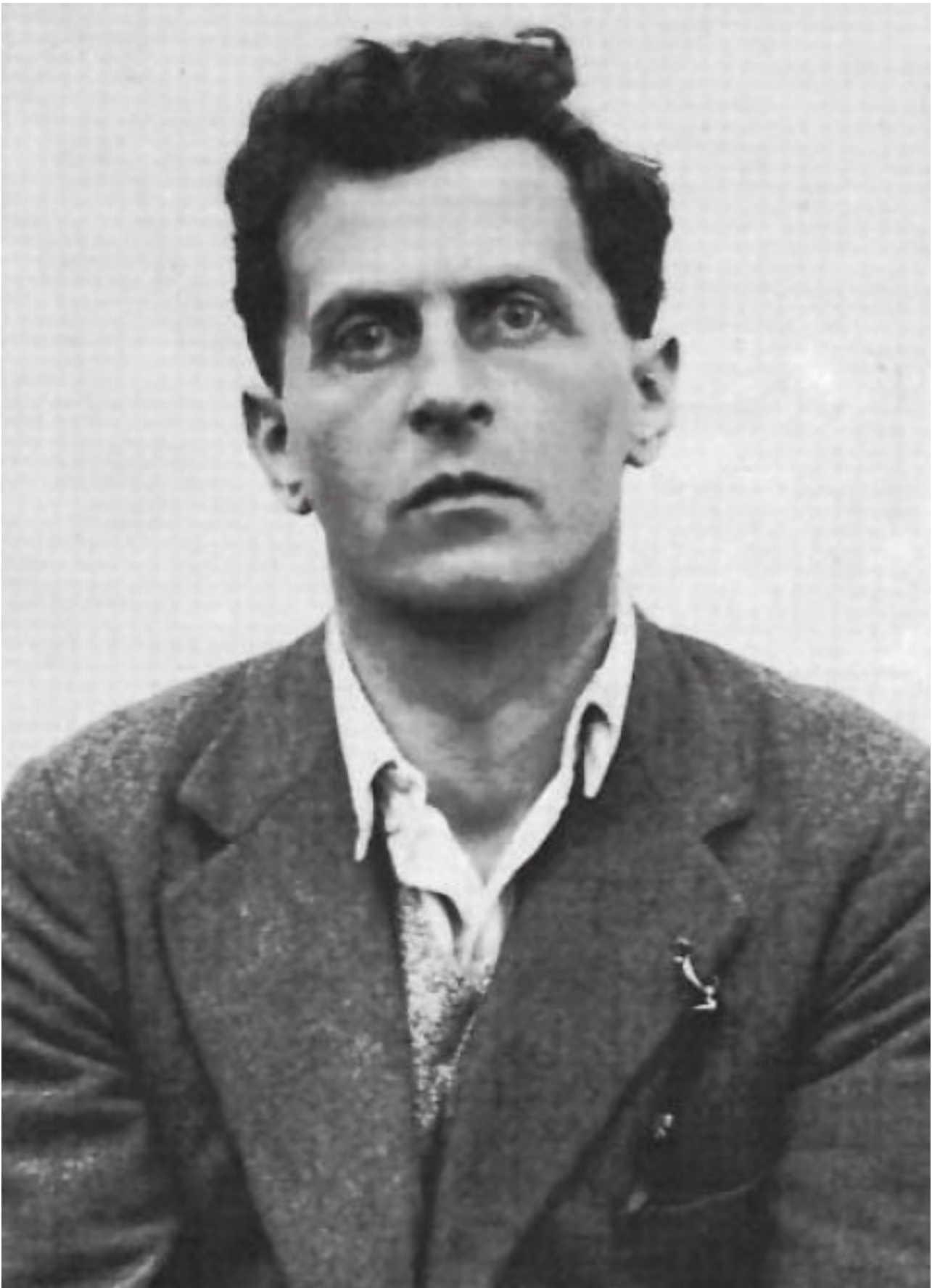
[3]Wittgenstein while receiving a scholarship from Trinity College, 1929 Public domain image