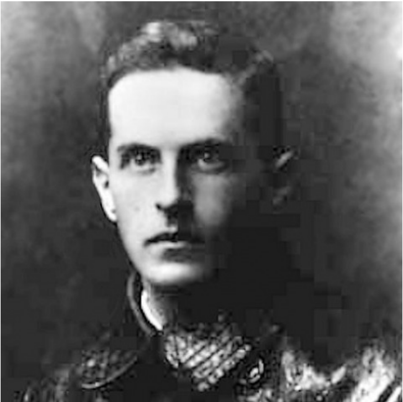
[8]Wittgenstein in 1920

When Wittgenstein first tried to publish the Tractatus , he titled it Der Satz , which in German means a proposition, a sentence, and also a leap. Through his propositions Wittgenstein tries to leap, that is, to use logic to bridge the chasm between language and the world. But he never reaches the other side; he falls: "Here I am conscious that I have fallen far short of the possible," he writes in the preface. 6 And reading the text, we can glean the circumstances under which things fall in it: they fall "under the concept," or "under the description." 7