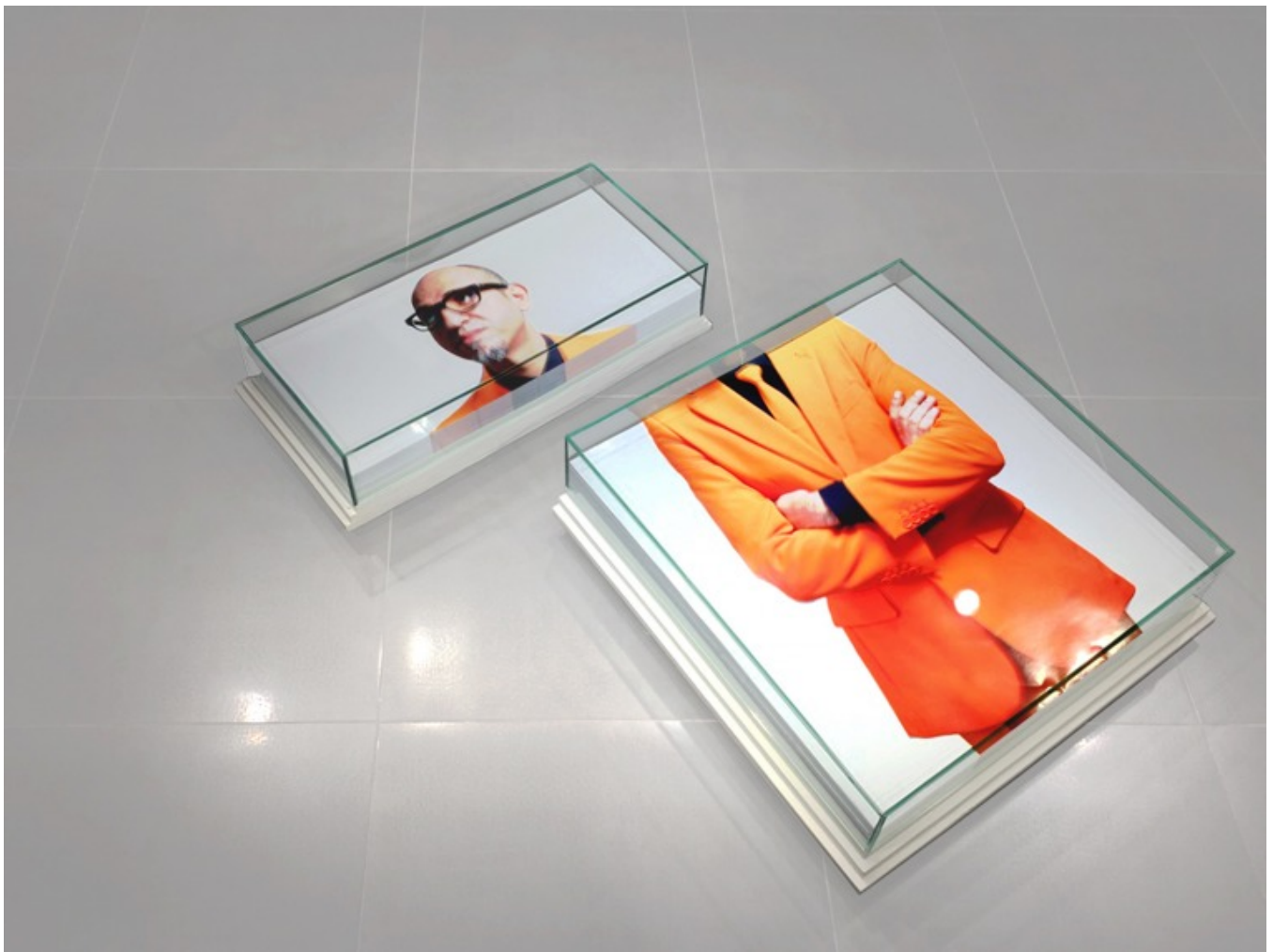
[3]Sharif Waked, Crop Marks , 2016

Floor installation, 2 boxes 35x75x20 cm and 71x75x20 cm, glass, wood, offset-printed poster & wheels