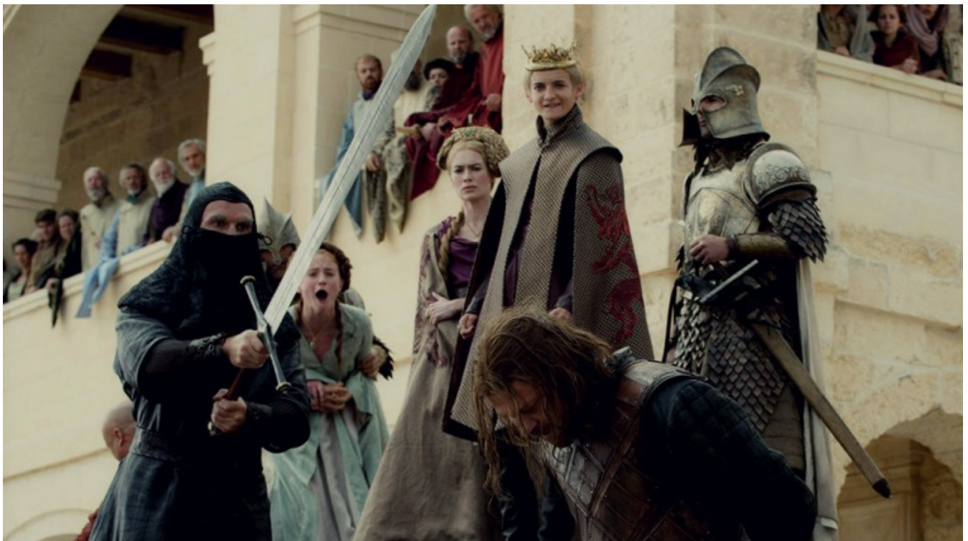
[7]Ned Stark's decapitation, Game of Thrones